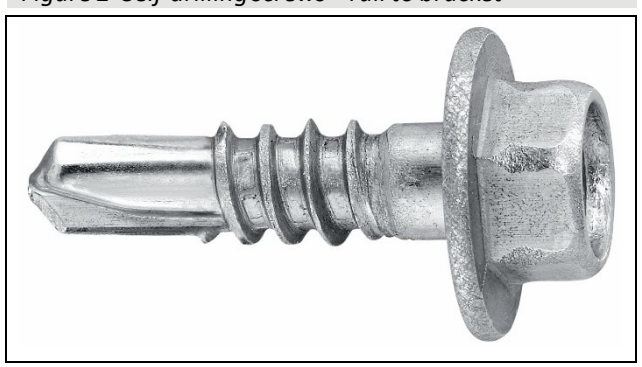
Figure 2 Self-drilling screws – rail to bracket

1.6 Ancillary items specified for use with the systems and recommended by the Certificate holder, but outside the scope of this Certificate, include: