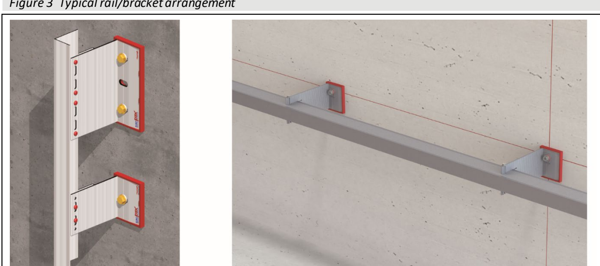
Figure 3 Typical rail/bracket arrangement

12.1 The systems must be installed in accordance with the Certificate holder's recommendations, the requirements of this Certificate and specifications laid down by the consulting engineer. Typical applications are shown in Figure 3.